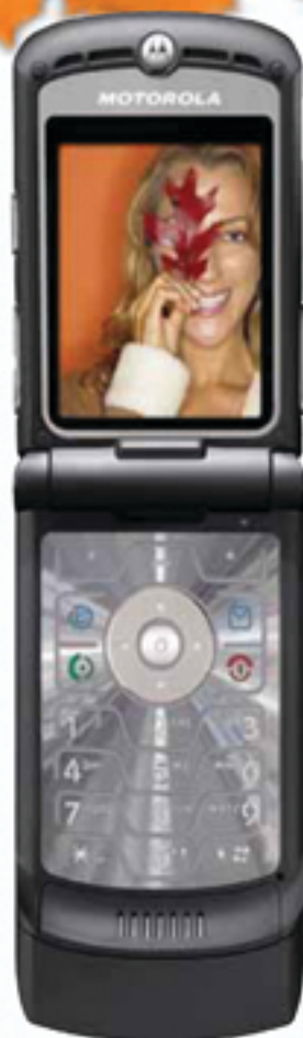
Motorola RAZR Black

Cingular's Treo 650 runs on EDGE, the fastest national wireless data network. palmOne